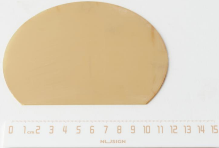
2 nd generation Piezoelectric Single Crystal