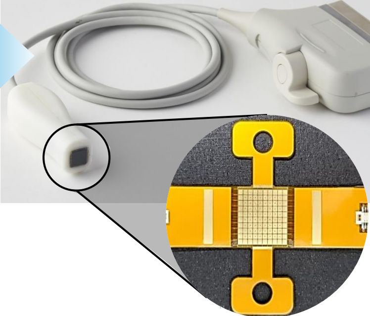
Fully Steerable 2D Ultrasound Probe